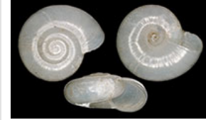
Photo(s): Views of a Glyphyalinia lewisiana shell.